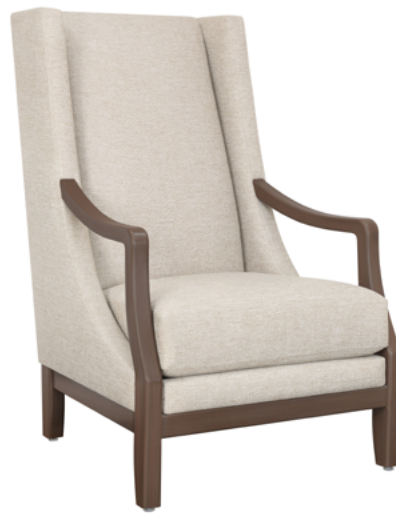
Model: LIO111 29.75W 35.5D 45.5H 25SW 19.5SD 19SH 25AH

Kwalu's Lioni Lounge chair is a sleek take on the classic wingback with unique points of interest. The high square back and wings of this chair create a quiet, cozy, semi-private space in common areas and lounges. Design details like scalloped arms and curved legs define high style. The seat cushion is removable for easy cleaning.